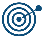
Focusing on your goals

Your approach to investment will vary depending on what you are looking to achieve.